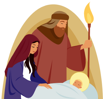
Wesołych Świąt Bożego Narodzenia