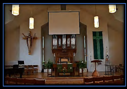
Sunday Worship 9:30

Office Hours Tuesday thru Thursday 9:00 AM – 1:00 PM