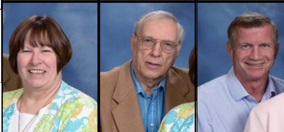
Lin Williams Fellowship