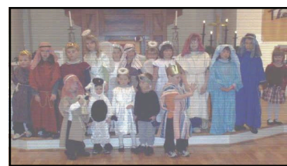
The Sunday School Children of Living God Church enacted the story of Christmas on Sunday, December 23.