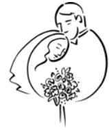
Marriage Affirmation Service

Please sign up on the bulletin board or call me to discuss details or questions. This is a fun yet romantic service and we want to plan a party for the participants and guests. A gratuity to the church (recommended $3 per guest), is all that is asked for.